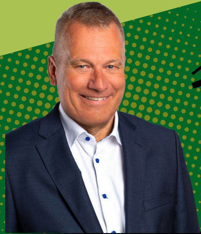
Winfried Muehling Pro Carton