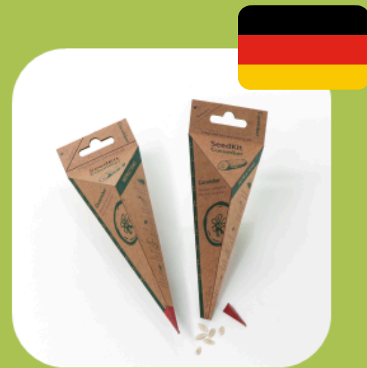
Creative Cartonboard Packaging All Other