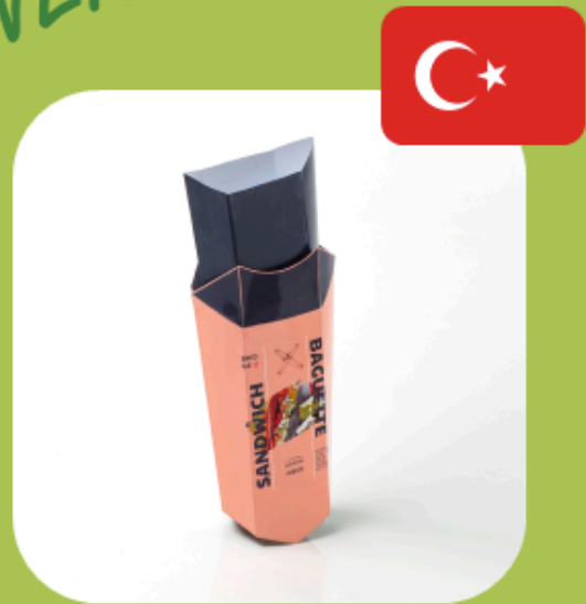
Creative Cartonboard Packaging Food & Drink